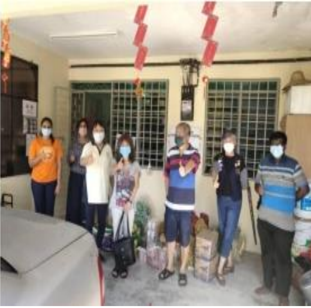
Groceries & food items for 10 poor families