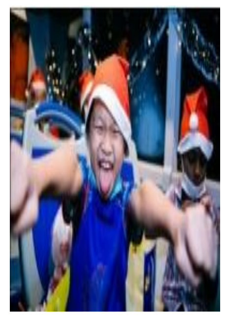
Praise of Home's orphans being taken for a ride round Ipoh town and given presents by Santa Claus