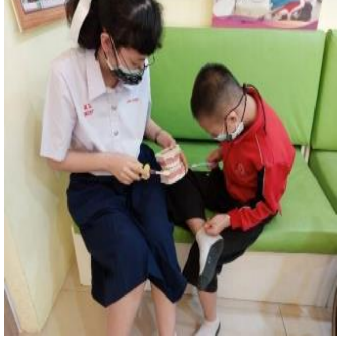
The youth volunteers provided oral health education