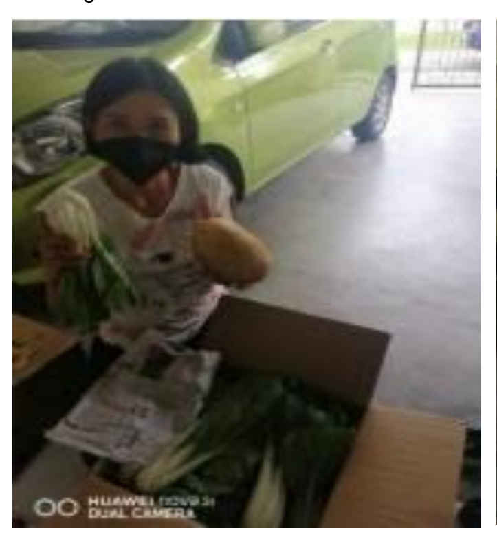
Project: Yishan Home (Single Mother Project) – donating vegetable and money to the home for the single mother and their children.