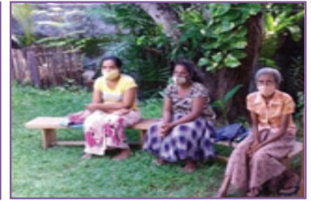
Distribution of Consumer Durables by Young Moratuwa Club at Blessings Child Care Centre