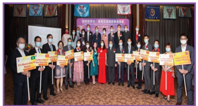
Club Presidents' handover ceremony in Hong Kong District