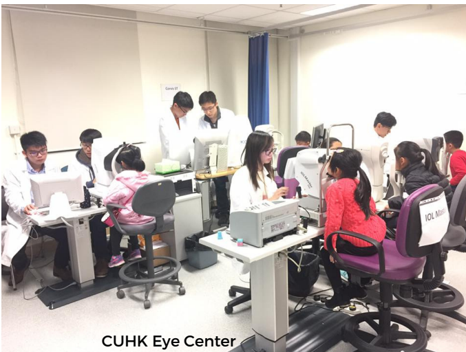
CUHK Eye Center