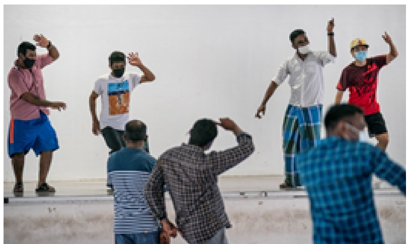
Deepavali Bhangra Dancing