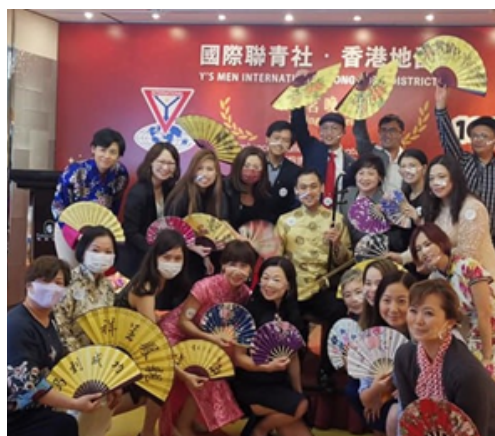
Last year District Spring Dinner was cancelled due to pandemic, fortunately we could organize the event successfully.