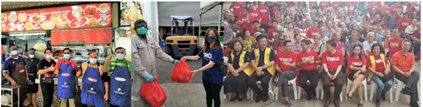
Indian Food Hawker Stall Food Distribution to a Migrant Worker Alpha Members attended the YMCA Silver Fiesta Program.

The International Y's Men's Club of Singapore (Alpha Chapter) lives up to its mission to support the YMCA. Since its charter in 1980, it has raised funds for various causes promoted by the YMCA of Singapore including raising funds for the rebuilding of the YMCA building and providing sponsorship to the annual YMCA Plain English Speaking Program as well as the annual YMCA Silver Fiesta Program for the elderly in the community. The outbreak of the COVID-19 pandemic in 2020 had resulted in such in-person programs to be put on hold. Migrant workers and low income groups were most adversely affected by the lockdown introduced by the Singapore Government to contain the spread of the virus. The Club responded and raised funds from its members towards the YMCA of Singapore's "Wok The Talk Project" which mobilized volunteers to deliver cooked food purchased from hawkers to migrant workers, the elderly and the low income groups.