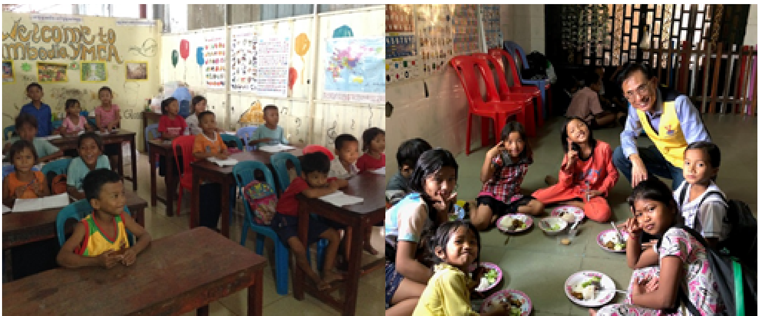
Street Children at CYMCA Learning Centre