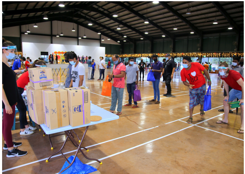
Beta Chapter Club offered games for migrant workers during Christmas.