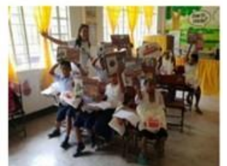
PROJECT HELLO ALSON BOOKS & SCIENCE KITS DISTRIBUTION. BENEFICIARIES - 100 HIGH SCHOOL STUDENTS