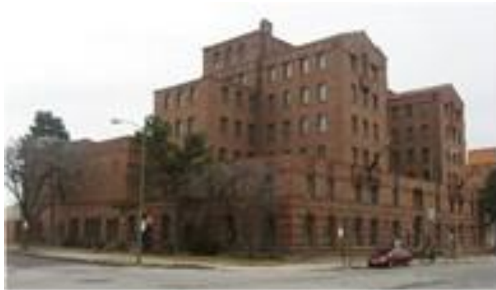
CENTRAL YMCA, TOLEDO OHIO, USA