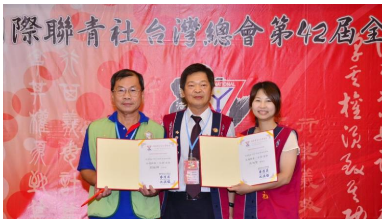
CERTIFICATE AWARD TO TOF PRIZE WINNERS