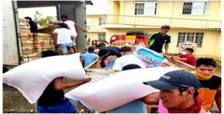
MANILA DOWNTOWN CATANDUANES (TYPHOON ROLLY) JOINT RELIEF - NOV. 17, 2020.

Y's Men's Club of RAHA Philippines Relief Operations in Bicol after Typhoon Rolly