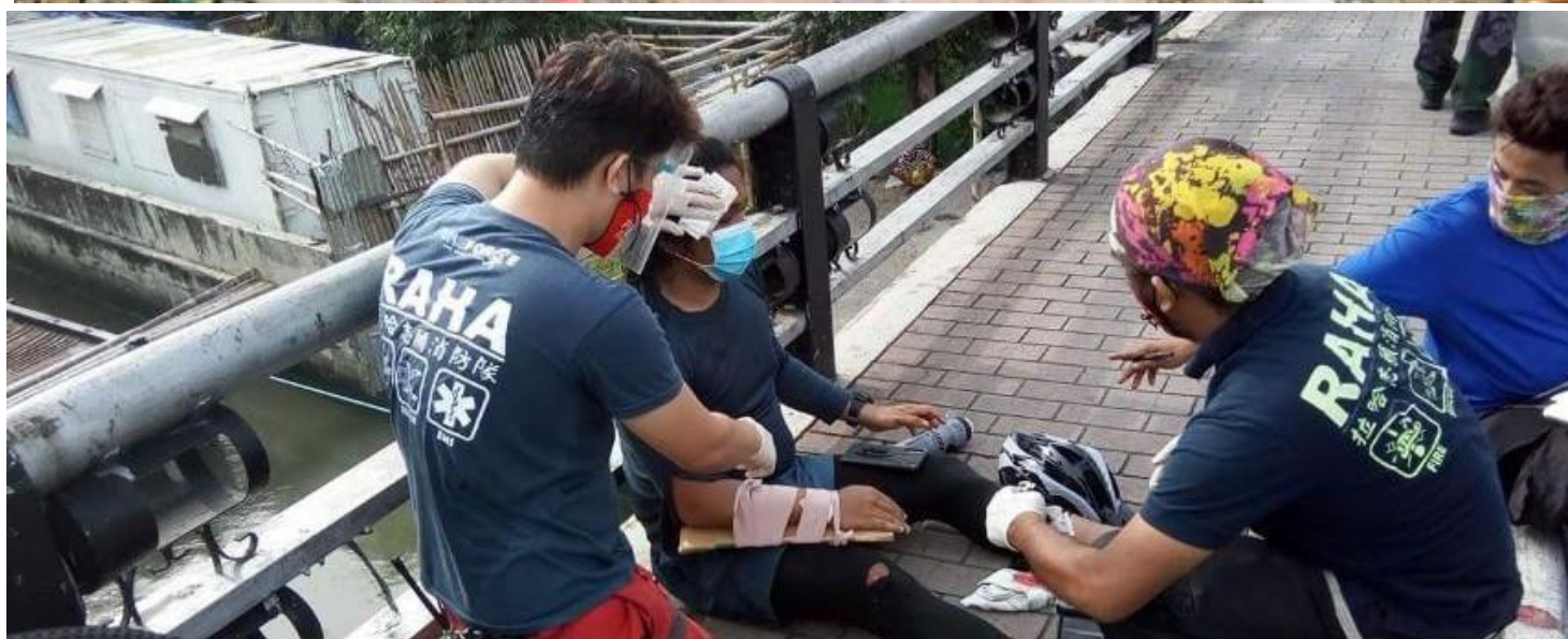
Y'S MEDIC AT WORK GIVING FIRST AID DURING ONE OF THE INCIDENTS HAPPENED ON MACARTHUR BRIDGE, NORTH BOUND IN MANILA.

Our 1st and 2nd objectives as a global part of Y's Men's International are to function primarily as a service club for the YMCA and to support other worthy organizations. With these two objectives in mind, community service is our principal purpose for being chartered as Y's Men's Clubs.