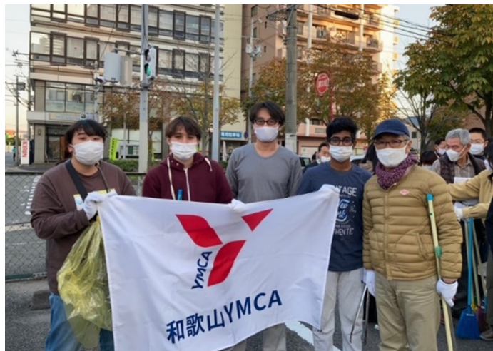
WAKAYAMA YMCA CLEANUP CAMPAIGN

In response to the "Week4Waste" campaign proposed by the International President, Wakayama YMCA, Wakayama YMC, and Kinokawa YMC co-organized the "Wakayama YMCA Cleanup Campaign" on Thursday, November 12, 2020 for about one hour for community service and social exchange. The area covered was from Japan Railway Wakayama Station to the area around the YMCA building.