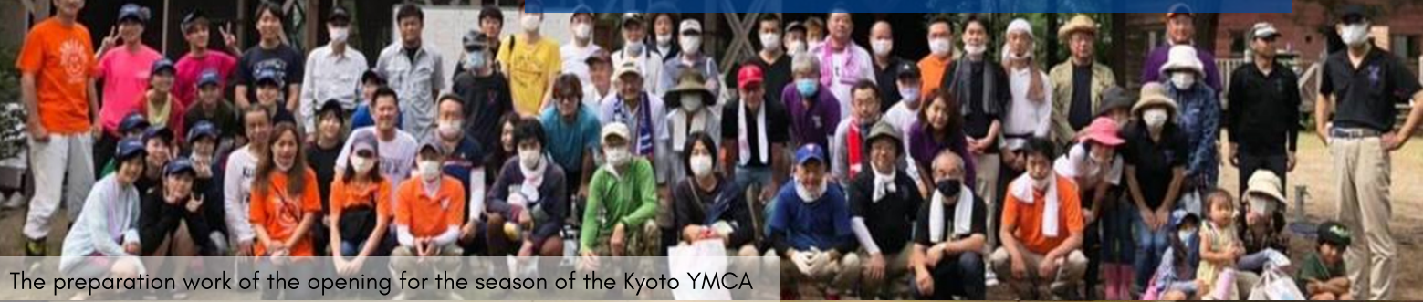
The preparation work of the opening for the season of the Kyoto YMCA Sabae Campsite by Y's Men and Women. Full story turn to page 4

THEME: MAKE A DIFFERENCE SLOGAN: INSPIRE