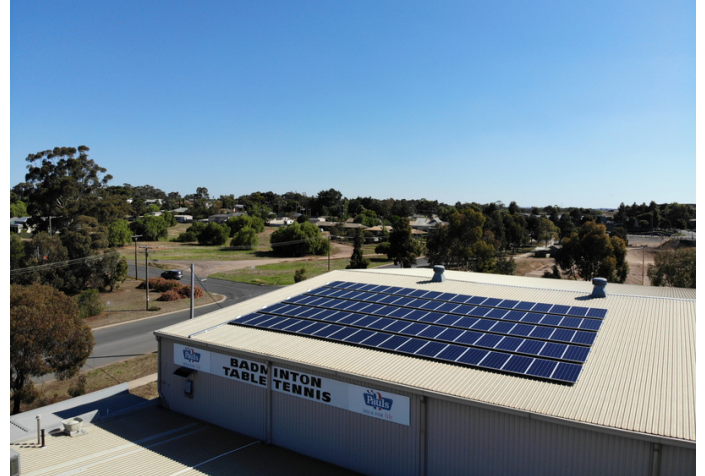
Photo beside is of a 30kW solar rooftop system on a table tennis & badminton stadium which was fully funded by crowd funding. The income is split 60% / 40% between host / Bendigo Sustainability Group. The term of the agreement is 10 years.

30kW would be the smallest system worth considering, but systems up to 100kW (cost about US$100,000) could be considered, which would result in a saving of about US$15,000 per annum.