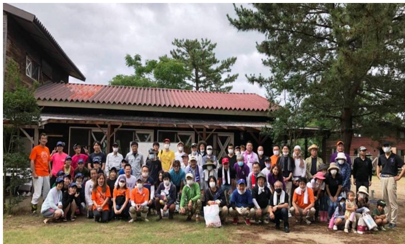
THE PREPARATION WORK OF THE OPENING FOR THE SEASON OF THE KYOTO YMCA SABAE CAMPSITE BY Y'S MEN AND WOMEN.