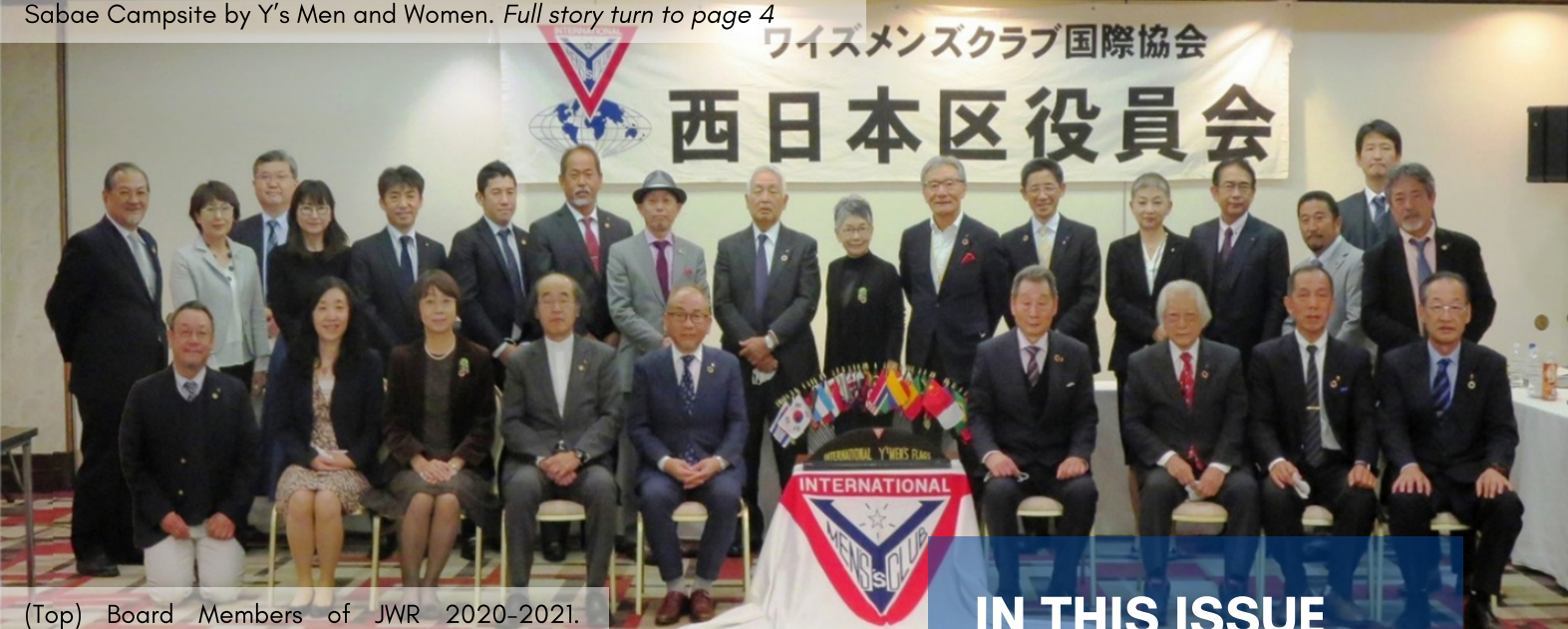
(Top) Board Members of JWR 2020-2021. (Bottom) Wakayama YMCA Cleanup Campaign. Full story turn to page 5