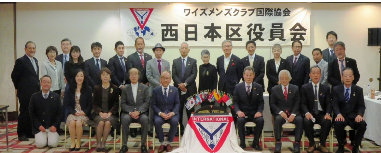
BOARD MEMBERS OF JAPAN WEST REGION 2020-2021

In conclusion, I believe that it is the mission of all the Y's Men of JWR to cooperate with each other in the ardent hope of restoring and revitalizing debilitating Y's Men's Clubs and local YMCAs.